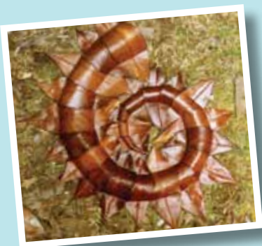
Leaves polished and greased, pinned to the ground with thorns.

Why don't you try making one next time you visit the coast?